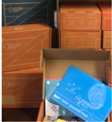
Top Right: Volunteer, Maddy, helped create re-usable STEM boxes for both houses. Far Left: Students from our Chapel location learn aerodynamics. Center: Middle School Students at Oxford location enjoy STEM learning. Bottom Right: The boxes that started it all.